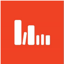
FREDERICK COUNTY PUBLIC LIBRARIES