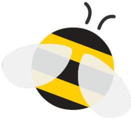
Scripps National Spelling Bee®